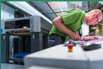
High-Quality Sheetfed Offset