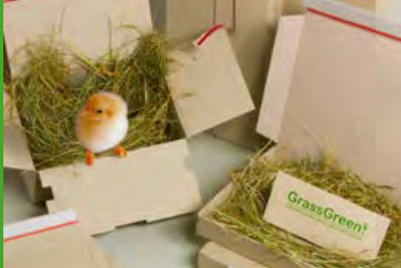
Communication and Image