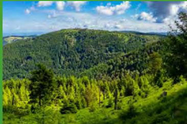
Protects the forests