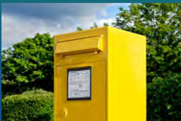
Optimized: Volume and Postage