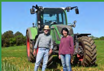
From regional agriculture