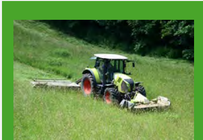
Fast renewable raw material