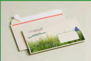
Digital Print for Smaller Quantities