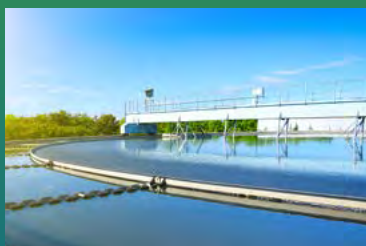
Much less water consumption