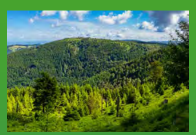
Protects the forests