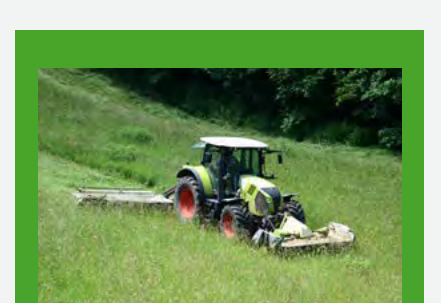
Fast renewable raw material