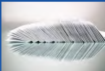
Ideal for small-scale series