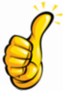
Short delivery times