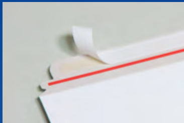
Powerful peel and seal