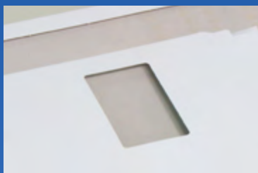
With and without address window