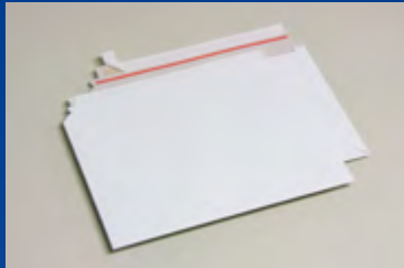
Elegant visual appearance