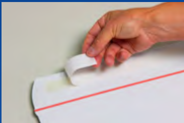
Powerful peel and seal