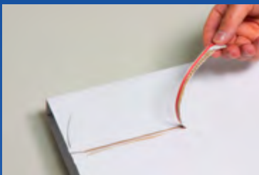
Easy, convenient opening