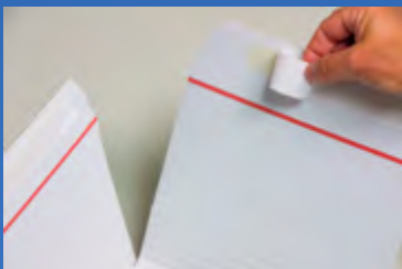
Plus: Additional safeguard inside