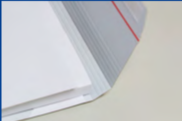
Adaptable fill height