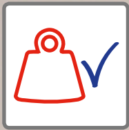
Strong, lasting bond