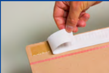
Powerful peel and seal