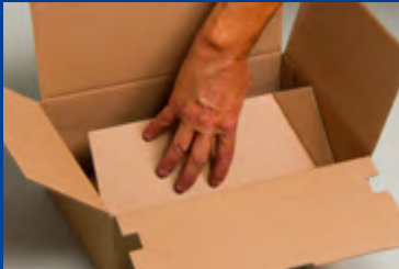
Quick and easy ready for dispatch