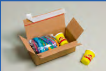
Ideal for online retail